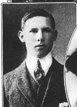
Crown Prince George of Greece