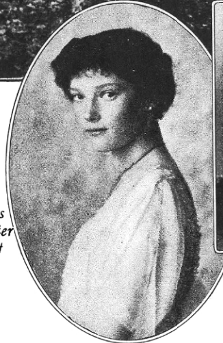
Grand Duchess Tatiana, daughter of the Czar of Russia