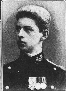
Crown Prince Charles of Roumania