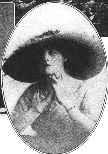
Princess Elizabeth of Roumania