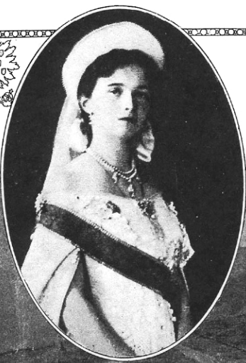
Grand Duchess Olga, daughter of the Czar of Russia